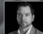
SAMUEL SÁNCHEZ Premi Nacional de Recerca al Talent Jove 2016