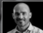
ROMAIN QUIDANT I Premi Banc de Sabadell a les Ciències i l'Enginyeria