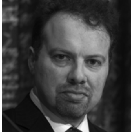
ADAM RIESS Nobel Prize in Physics 2011