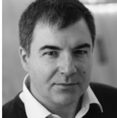
KONSTANTIN NOVOSELOV Nobel Prize in Physics 2010