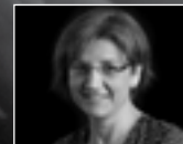
CARME ROVIRA I VIRGILI Premi Ciutat de Barcelona 2016, Ciències Experimentals