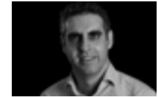
MANEL ESTELLER Medalla d'Honor del Parlament de Catalunya Premi Nacional de Recerca Premi Internacional Catalunya